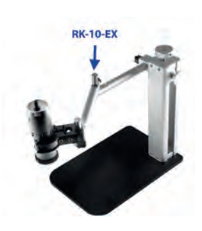
RK-10-EX Additional horizontalarm (included with RK-10A & RK-06A)