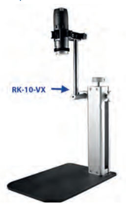
RK-10-VX Vertical arm extension