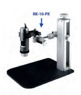
RK-10-PX XY positioning arm with accurate and smooth adjustment options