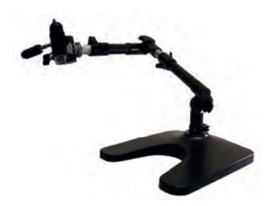
MS52BA2 The MS52BA2 is a combination of the rigid MS52B articulating flex-arm and a desktop base rack