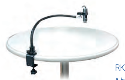
RK-02 A heavy duty gooseneck stand

For precision focus and stable viewing in a compact design. Due to the precision vertical movement of the holster, a steady view can be obtained, even at higher magnifications.